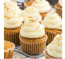
Carrot Cake Cupcakes