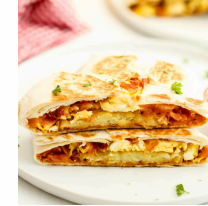
Taco Bell Breakfast Crunchwrap