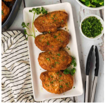
Air Fryer Shake and Bake Pork Chops