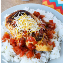
Tex-Mex Skillet Chicken