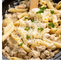
Crockpot Olive Garden Chicken Pasta