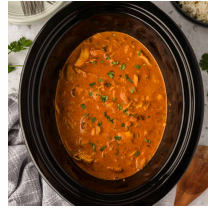
Slow Cooker Chicken Tikka Masala