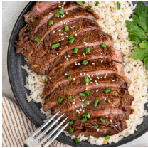
Grilled Teriyaki Steak