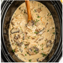
Slow Cooker Chicken Stroganoff