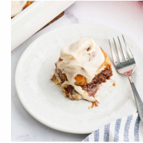
Hawaiian Roll Cinnamon Rolls