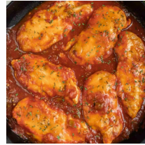
Skillet Salsa Chicken