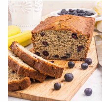
Blueberry Banana Bread