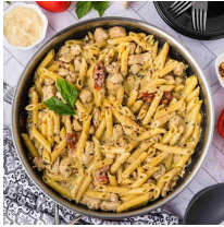
Chicken Pesto Pasta