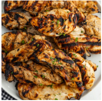
Cracker Barrel Chicken Tenders