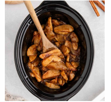
Slow Cooker Apples