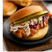
Hot Honey Chicken Sandwich