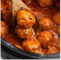
Buffalo Chicken Meatballs