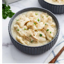
Chicken & Dumpling w/ Biscuits