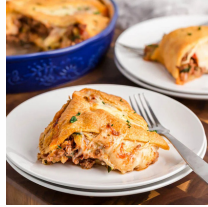
Italian Crescent Casserole